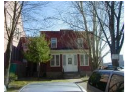
Office is in the house attached to Hope Community Church