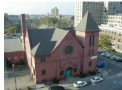
Hope Community Church, on corner of 7th St and 10th Ave.